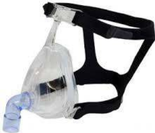
Full Face Mask